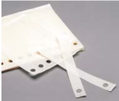
94291 2- ea Clik-Clik™ Adhesive Strips