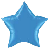
4- ea 71ST-04 Sapphire Blue 4" Qualatex® Star