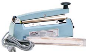
HS870 Maxi Seal® Heat Sealer