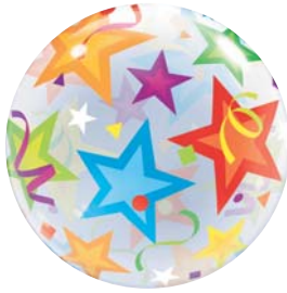
1- ea 2539-26 22" Bubbles™ balloon